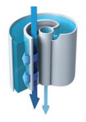
Figure 1. Flow-through view of a RiOs<sup>™</sup> Essential system RO membrane, which is inserted into a cartridge. Tangential flow limits the risk of fouling; the membrane removes 95-99% of inorganics and 99% of all dissolved organic substances with greater than 200 Dalton, such as microorganisms and particles.